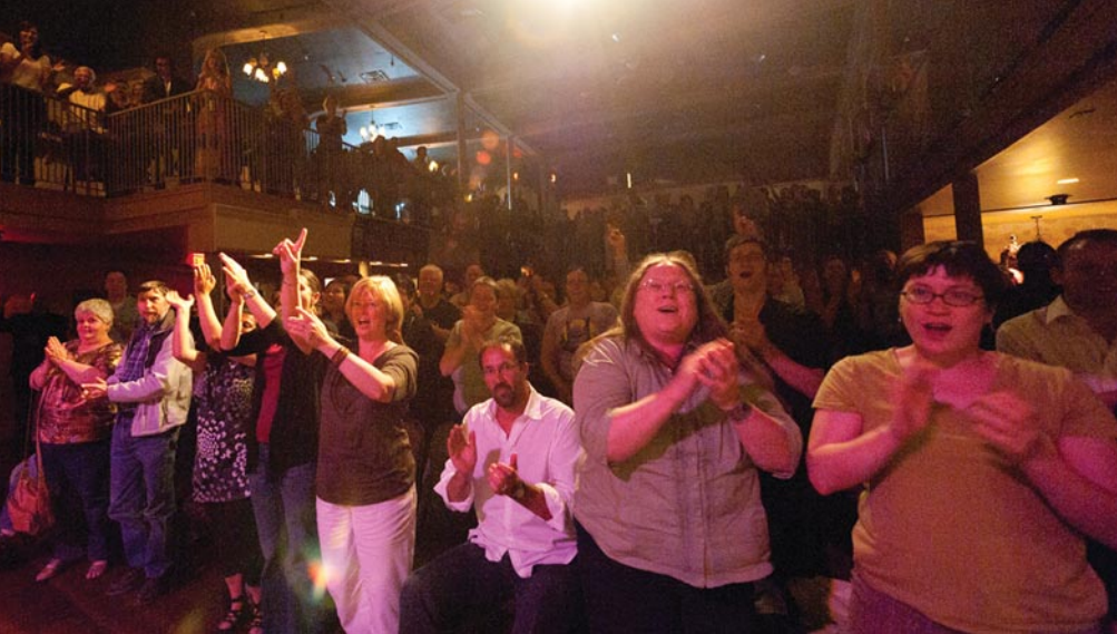
An enthusiastic crowd of blues fans at the Wreckhouse Jazz and Blues Festival.