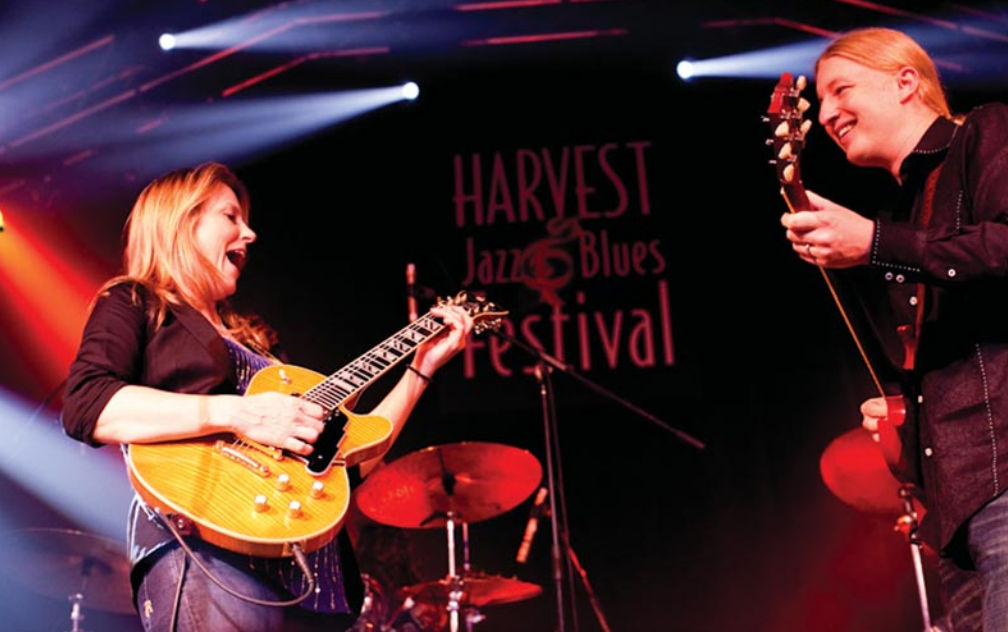
Husband and wife duo Derek Trucks and Susan Tedeschi take to the stage.

local high school students performed a series of outdoor jazz concerts on Richmond Street. They convinced local merchants to contribute some funds to cover their costs and the students added a lively musical element to the street scene. Eventually a committee was formed to establish the annual music festival that now also embraces the blues.